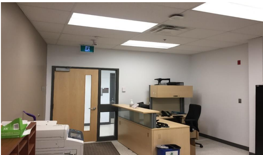
Photo 2: View of typical finishes observed in 850 Peter Morand Crescent.