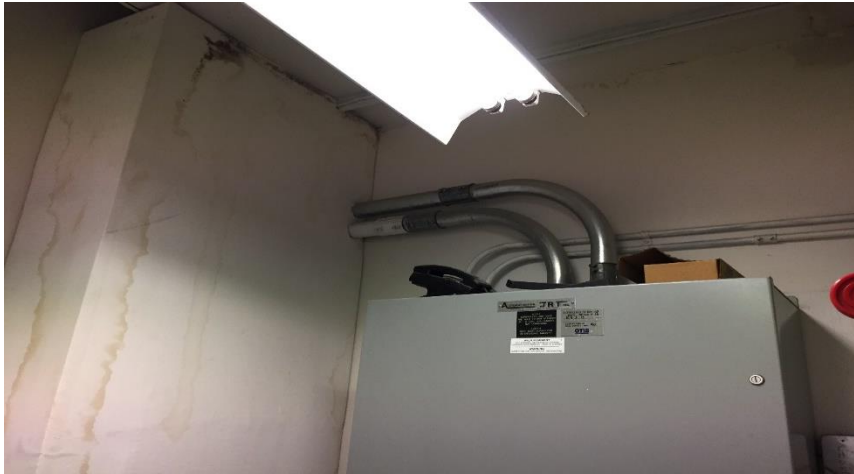
Photo 4: View of suspect mould growth observed on drywall in Room 100D.