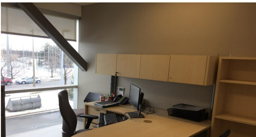
Photo 3: View of typical finishes observed in 850 Peter Morand Crescent.