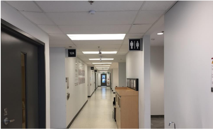
Photo 1: View of typical finishes observed in 850 Peter Morand Crescent.