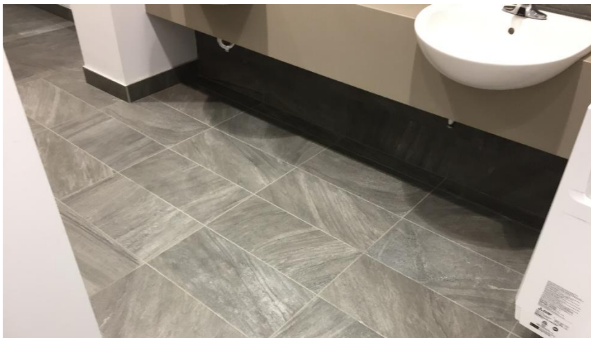
Photo 6: Typical view of ceramic floor tile grout observed throughout the subject building suspected of containing asbestos.