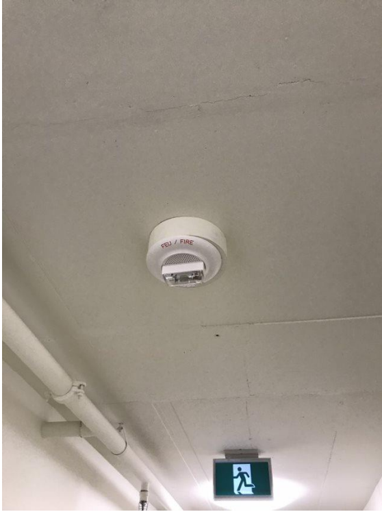
Photo 1: Representative view of the smoke detectors containing small amounts of isotope Americium 241, observed throughout the subject building.